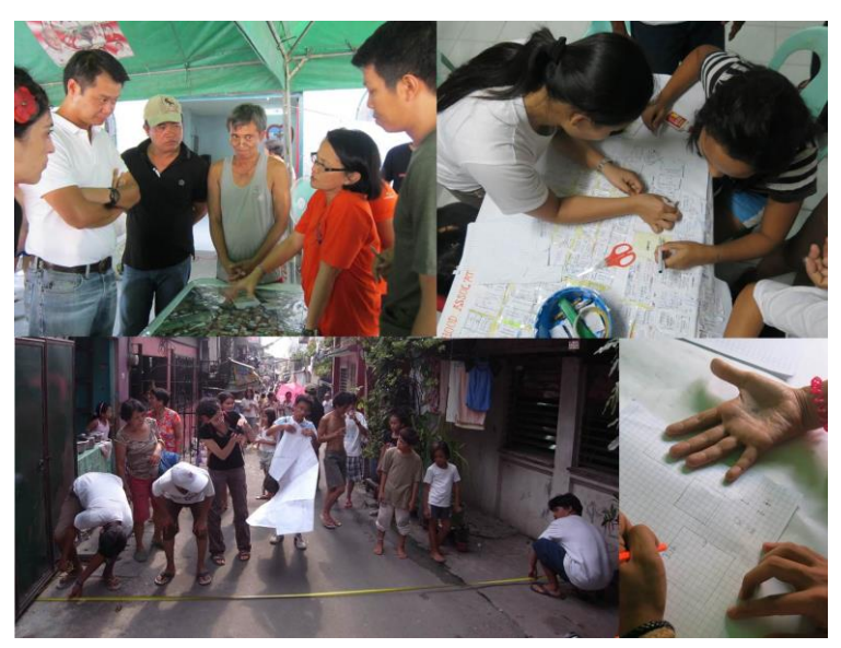
Figure 2 - Community work in Barangay Bagbaguin: discussing with Valenzuela Mayor; measuring; scale drawing; map-making

People analysed the possibility of widening roads, respecting safety requirements while minimizing interventions on existing houses. They also evaluated options for creating additional access points to the settlement. The map was of great value when devising alternative solutions and discussing proposals with Valenzuela City's Mayor and municipal officers. Indeed it enabled conditions for constructive dialogue and supported fruitful negotiations between the two sides.