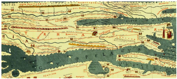
Figure 3 - An extract of the Tabula Peutingeriana

represents the state-run road network of the Roman Empire (Fig. 3).