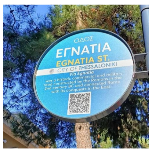
Figure 6 - Example of recent sign scattered along Via Egnatia (Authors' own photograph, January 2023)

Although some initiatives did already exist prior to FuoriVia's project (among the most notable, an archeologyoriented EU-funded project; EC, 2017), FVE and other activities held on Via Egnatia in recent years, including several scientific congresses, have favored a thriving debate and the launch of several valorization and study projects, as well as the start of the process of recognition as historic route by the Governments of Albania and North Macedonia and the inclusion of Via Egnatia in cultural manifestos (Ungaro, 2023). The path to the development of Via Egnatia towards a recognized transcontinental LDWR seems traced: more institutional and bottom-up efforts are needed to valorize the first tiles laid by FuoriVia and its partners. In this regard, a symbolic but relevant step forward was marked in March 2023, when Via Egnatia Foundation published the second and final part of their walkers' guide, covering the section between Thessaloniki and Istanbul (van Attekum and de Bruin, 2023).