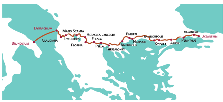
Figure 2 - The main stations of the Via Egnatia (Chiara Costantini, 2019)

recently confirmed that the original itinerary ran through Thrace, providing an essential infrastructure for the Roman conquest of the region between the 2nd and the 1st centuries BC (Lolos, 2007; Walbank, 2002) [2]. In fact, from Neapolis the road continued its course to Traianoupolis (Alexandroupoli), Pheres and Kypsela (Ipsala) and ended in the Bosporus Strait (Fig. 2).