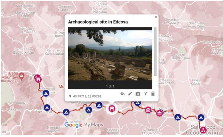
Figure 5 - Example of an interactive output of FVE (Author's elaboration)

(Fig. 5), including GPS tracks of the walked itinerary, that are publicly available upon request (for non-market uses only).