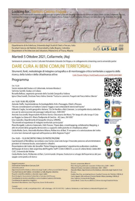
Figure 5 - Seminar programme "Dare cura ai beni comuni territoriali", Municipality of Collarmele, October 5th 2021

This experimentation was not promoted with the sole purpose of encouraging the participation of international students interested in the topic, but also to experiment and test new ways of intangible connection in the field - widely tested in distance learning during the lockdown periods linked to the COVID SARS2 emergency - and increasingly desired in these areas. The students connected to the network from the universities in Colombia and Albania to the educational activities carried out in the small towns of Collarmele, Pratola Peligna and Rocca Pia were able to share the direct experience of their fellow students following at a