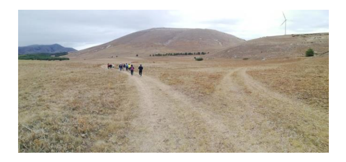
Figure 8 - Collarmele Tratturo October 6th 2022, (photo by L. Simionato)

were in any case investigated within the territories of the municipality of Sulmona, Pettorano sul Gizio, Rocca Pia, Roccaraso and Rivisondoli. All the steps were in any case identified based on a preliminary work conducted on a cadastral basis and the return of geographical data on dedicated applications that can be used in the field investigation via simple smart phones. For a stretch of the Altopiano delle Cinquemiglia, the use of a drone was also tested, which allowed the return of an accurate video and photographic repertoire.