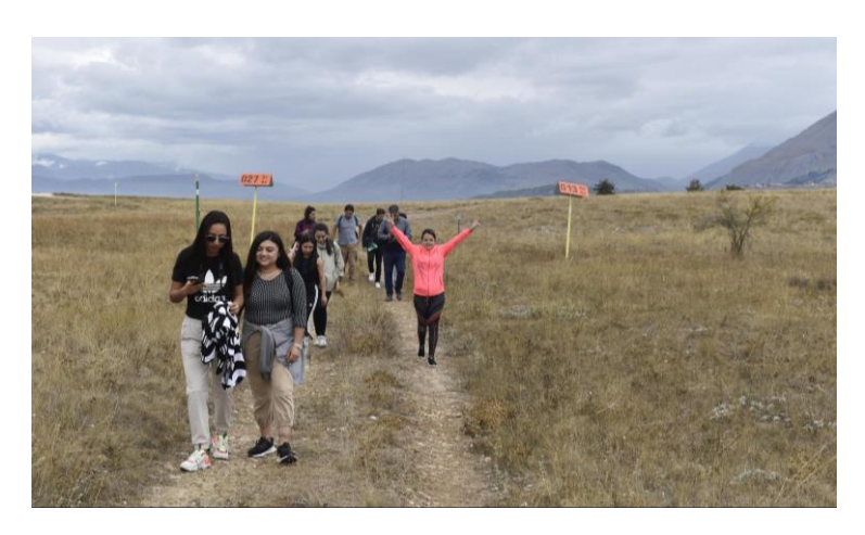
Figure 2 - First step Celano-Collarmele, Piana di Celano, October 5th 2021

"[The Celano-Foggia is] one of the five great routes of the horizontal transhumance (...) the most inland of them all: thanks to its position, it is the one that fits best into the enormous network of herding routes that innervated all the most important centres of central and southern Italy. (...) Its route starts from Celano, in Marsica (inland Abruzzo), and reaches the Tavoliere delle Puglie, ending in Foggia, crossing valleys and plateaus in a south-easterly direction and almost always staying on the Adriatic side of the Apennine watershed. (...) According to the census carried out by the Corps of Foresters in 1993, the only and last available, its route had been reduced to 189 km (compared to the original 208 km) and only 80 km had been restored, the state of conservation was poor for a similar length, very precarious for 20 km, and even non-existent for 103 km (...) The very precarious state is due above all to the use of the sheep-track surface for agricultural and forestry purposes and its occupation by roads, railways, power lines and other infrastructures." (Gregg and Petruccione, 2013).