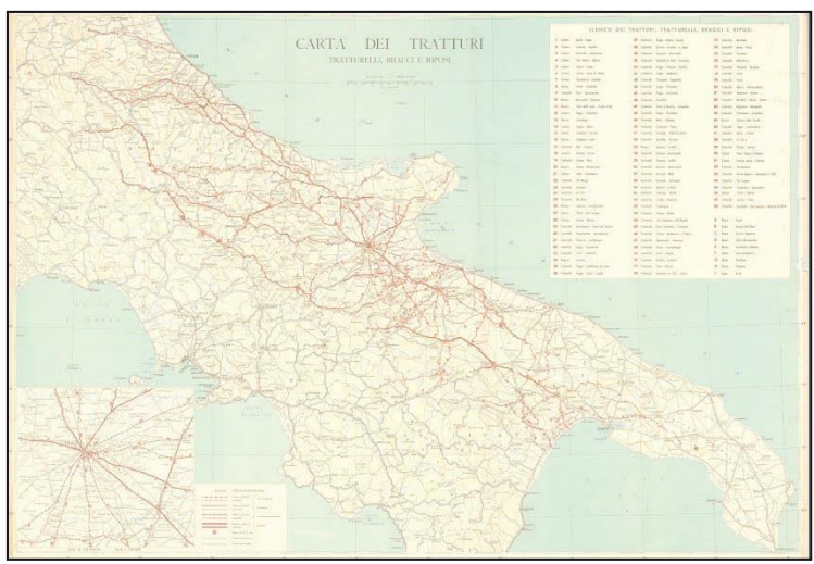
Figure 1 – "Carta dei Tratturi, Tratturelli, bracci e riposi", map of the sheep-tracks published by the Commissariat for the reintegration of the Foggia sheep-tracks