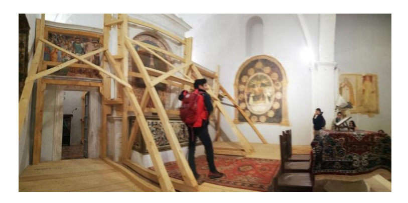
Figure 7 - Collarmele, Tratturo Celano-Foggia, October 6th 2022 Church of "Madonna delle Grazie"

and during the duration of the laboratory through forms of assisted self-construction, self-financed through crowdfunding programs. The pilot areas were to be previously identified with the Associations and local administrations involved, or subsequently during the critical path.