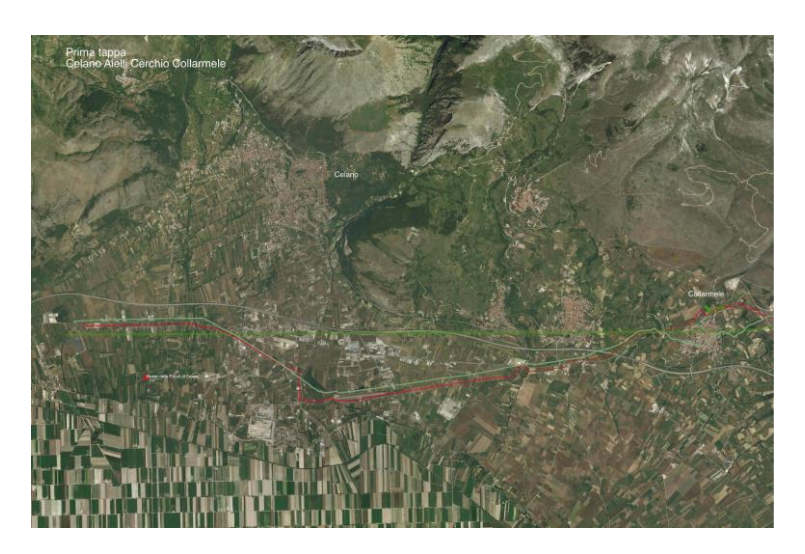
Figure 4 - GIS environment processing of the Tratturo Celano - Foggia route in the initial section, in red as recognized as an archaeological constraint (DM 42/20024) by the Superintendency of Archaeology, Fine Arts and Landscape for the provinces of L'Aquila and Teramo

A seminar for the public presentation of the results achieved on October 11, 2021.