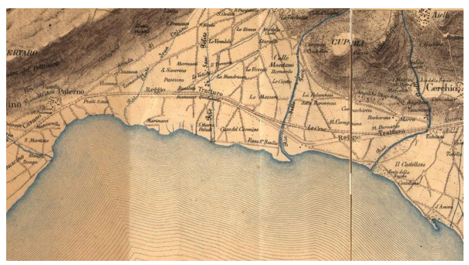
Figure 3 - Initial section of the Tratturo Regio Celano-Foggia (IGM, 1865)

According to the initial work program of the workshop the rediscovery and transcription of this historical path was first made on maps and then became an opportunity for civic monitoring of the current condition of a property still largely state-owned (Fig. 3).