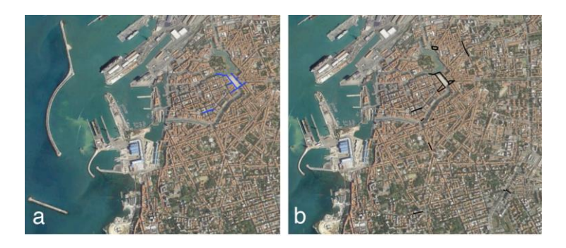
Figure 2 - The resulting location of parking sites in Leghorn

urban studies, as a reliable tool for powerfully supporting planning and decision-making. Furthermore, a similar approach can be easily extended to the location of other urban activities, differently related to the distribution and influence of movement.