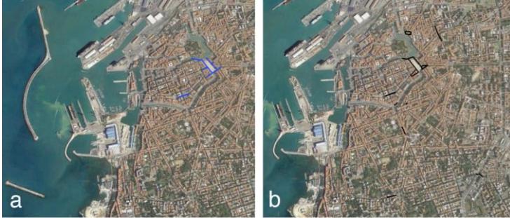
Figure 2 - The resulting location of parking sites in Leghorn

urban studies, as a reliable tool for powerfully supporting planning and decision-making. Furthermore, a similar approach can be easily extended to the location of other urban activities, differently related to the distribution and influence of movement.